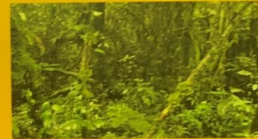
Habitat: tropical rainforests