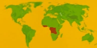
Range: central Africa

I may see yellow signs that explain what each animal is and where they live.