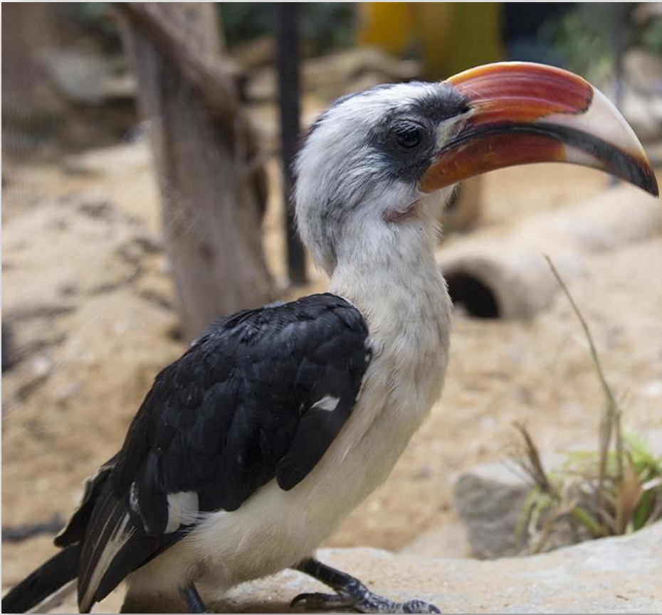
Von der Decken's Hornbill